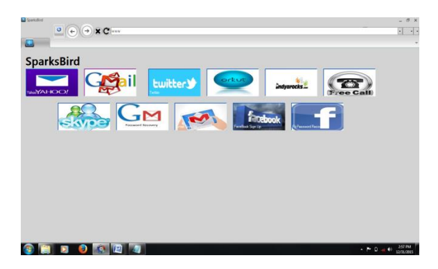
Fig 2. Multiple Web Browser