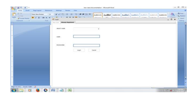
Fig 4. Private Browsing: Login Process