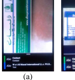
(b) Figure 3. Business Card Detection