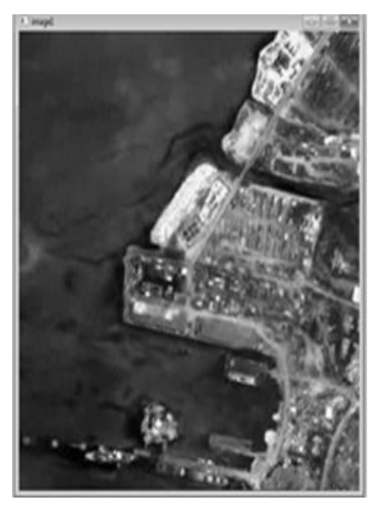
Fig.6: Original image