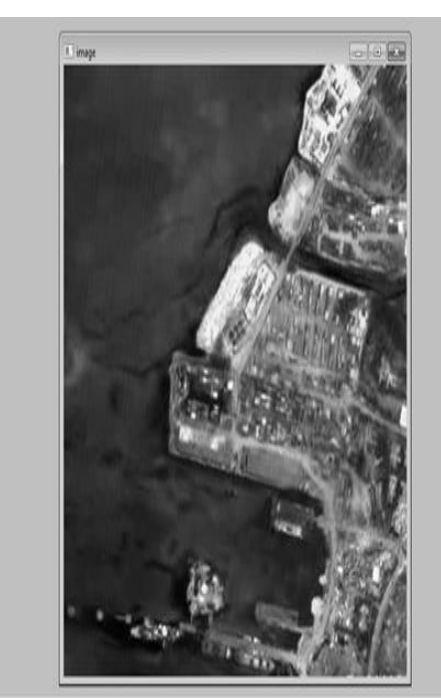
Fig.7: Image converted to grayscale