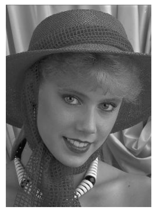
Fig.1: Original image