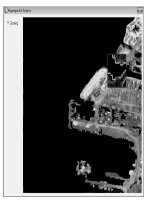
Fig.9: Example of an image that zooms a location