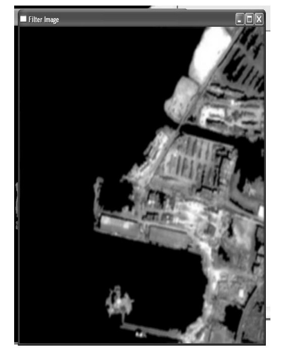
Fig.10: Example of an image smoothened