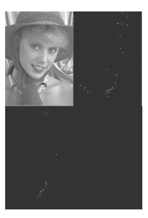
Fig.3: Preprocessed image