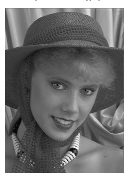
Fig.5: Restored refined image