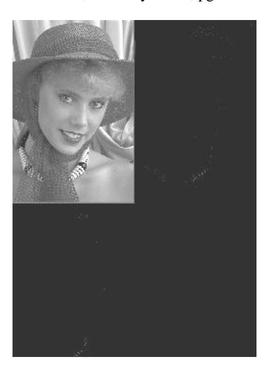
Fig.4: Refinement mapping