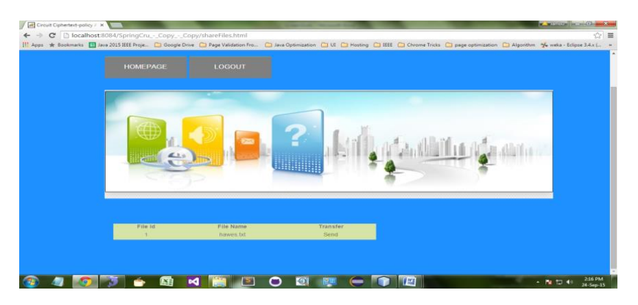
Fig 4. File Sharing process between sender and receiver

In this module, the uploaded files are shared to the friends or users. In this, the Data Owner set the time to expire the data in Cloud. The Private Key of the Shared Data will be send through Email.