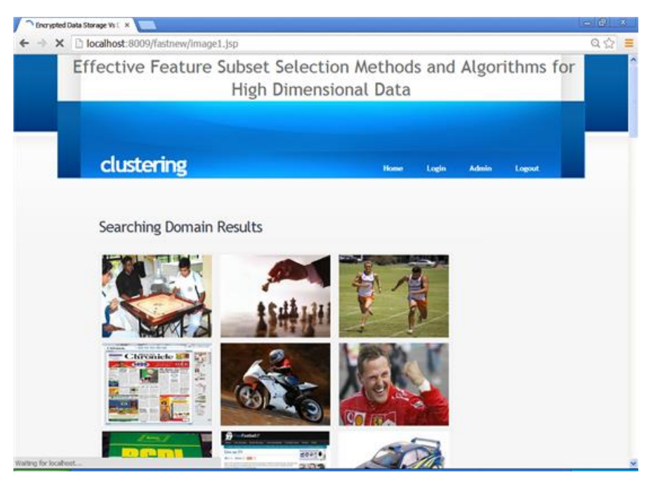
Figure 3. results of searched information