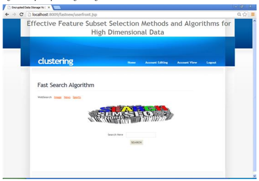
Figure 2. user searching images

from a problem domain while retaining a suitably high accuracy in representing the original features. Idea behind feature selection is to choose a subset of input variables by eliminating features with little or no predictive information. Feature selection is to determine a minimal feature subset from a problem domain while retaining a suitably high accuracy in representing the original features.